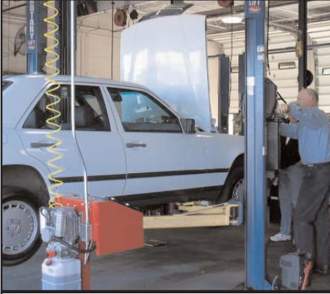
Tech Session - Brown Mercedes