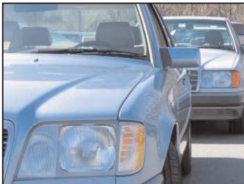
Tech Session at Brown Mercedes Charlottesville, VA

Members receive the email newsletter usually a week or so before the snail mail. You'll also receive last minute event updates.