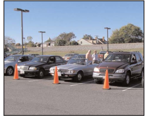
Photo rally, winery tour, holiday party, and the list of local events goes on. And, if you want more there are literally hundreds of events held throughout the country ever year. One of my personal favorites is the Greater Washington Section's Annual Picnic held in Potomac, MD (August).

To top it off we enjoyed delicious, mouth watering treats; everyone brought their favorite dessert.